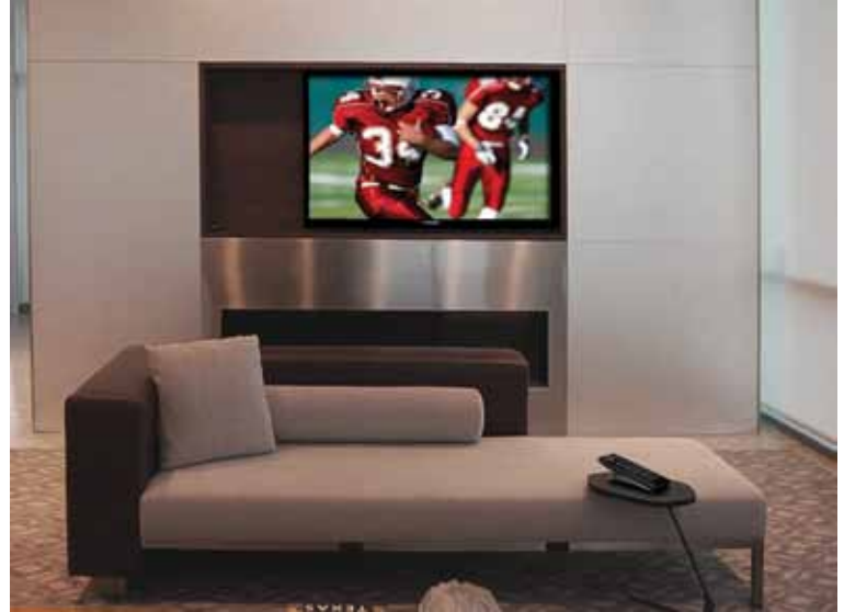
SoundImage built four different surround sound systems. In the master bedroom, living room (pictured), and game room, they used Rotel RSK-1560 7.1 AV receivers, also with Triad invisible speakers and JL Audio subs. In the media room, SoundImage techs installed a McIntosh MX150 surround processor, MC207 amplifier, Bowers & Wilkins loudspeakers, and JL Audio in-wall subs.

Militello said makes a big difference, especially in the summer.