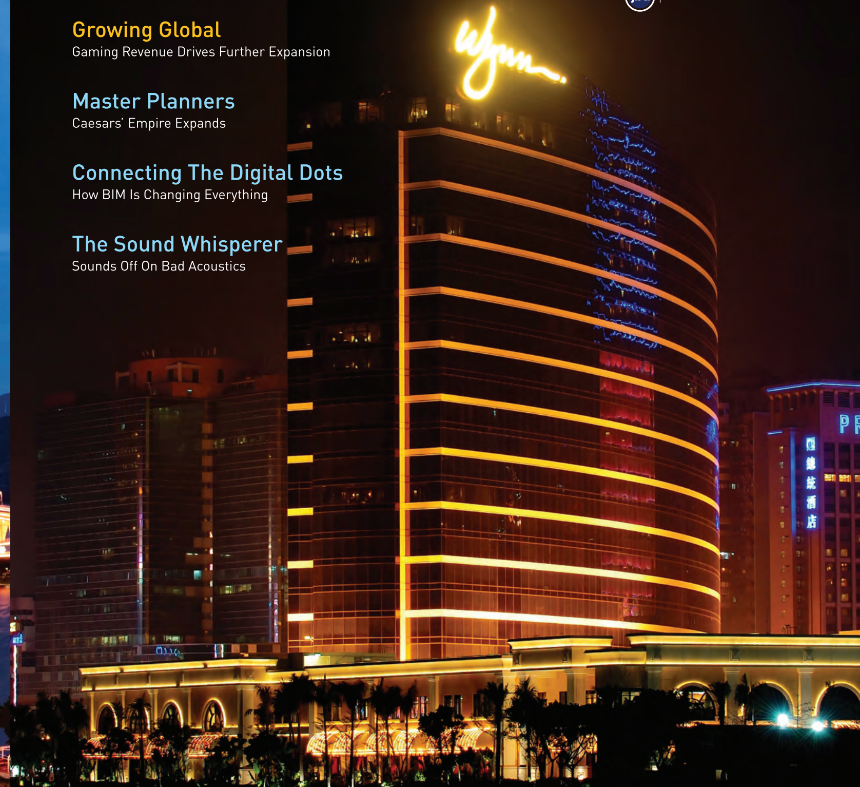
Wynn Resort, Macau

Audiovisual Experience | Manning's Takes Center Stage in New Orleans