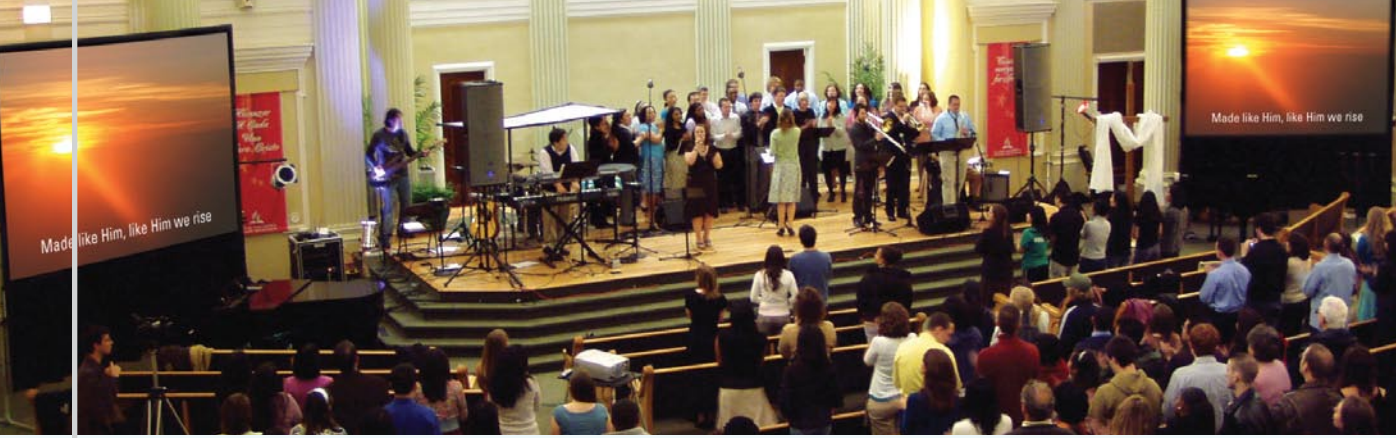
At left: video and audio provided on a rental basis for New Community Covenant Church, Chicago.