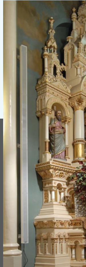
Above: steerable line array installed at St. Michael in Old Town, Chicago.

Specialists in AV systems for difficult environments