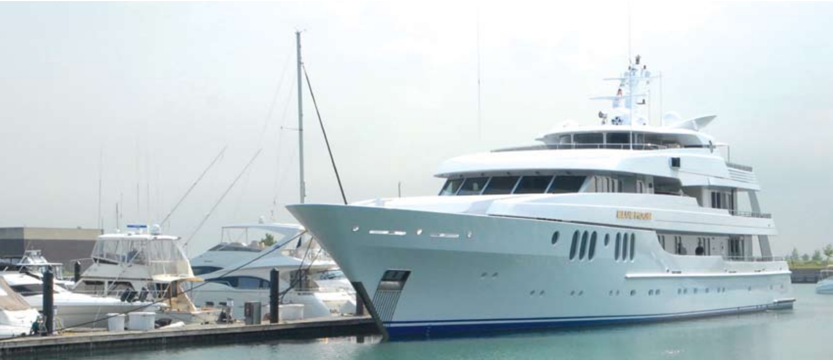
Bon Voyage The Blue Moon is docked and ready for its next adventure

"We use the AMX system to distribute and control all the audio visual functions on board – from a centralized rack area in the bridge, to every cabin or room on the boat."