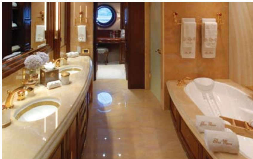
Elegance Redefined No detail is overlooked in the luxurious master bath