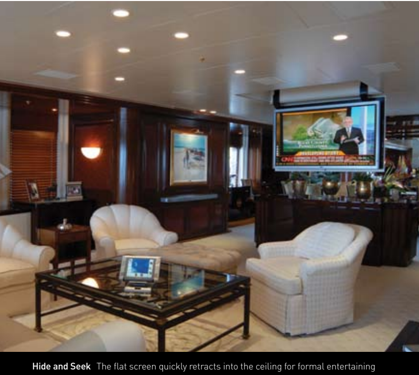
Hide and Seek The flat screen quickly retracts into the ceiling for formal entertaining