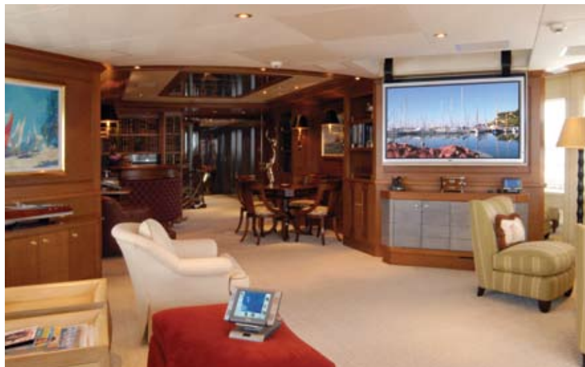
Sit Back and Relax The wireless touch panel provides control from anywhere in the room

The Blue Moon is an impressive piece of art and engineering – good enough to win a Monaco Showboat International “Best Yacht” award last year, and good enough to handle a Duchossois granddaughter’s recent wedding reception. For this family-centered businessman, that was perhaps the more impressive achievement.