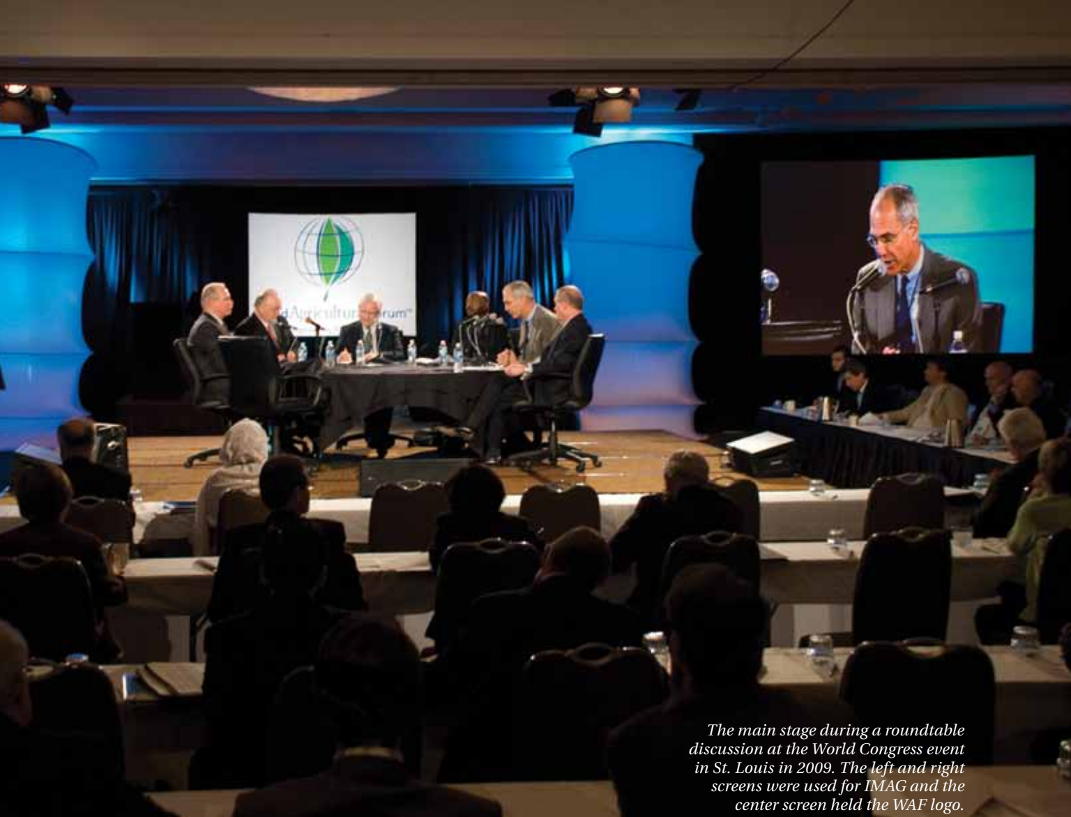
The main stage during a roundtable discussion at the World Congress event in St. Louis in 2009. The left and right screens were used for IMAG and the center screen held the WAF logo.

Instead of three projectors to serve these three screens, CTI used six, with one projector on each screen designated as the primary unit and one as a backup. “It’s actually very rare that we’ll have a projector fail during a presentation,” Smith says, “but if it happens, all we need to do is throw a switch and the backup comes online.” CTI technicians thus set up four 10,000-lumen Christie projectors to serve the left and right screens and two 8000-lumen Christies to serve the center screen with the WAF logo.