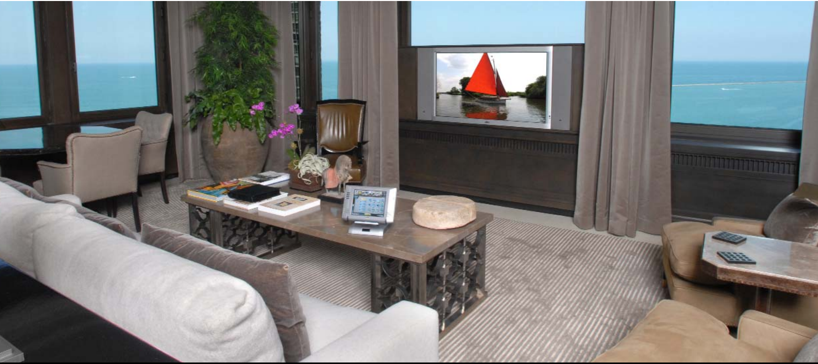
A Room With A View: The AMX Touch Panel instantly draws the shades, dims the lighting and plays a movie - all with one touch.

"We sat down with representatives from AMX, and they said 'we're going to make it simple for you. We will interface with everything that you need in your home to whatever extent you want.'