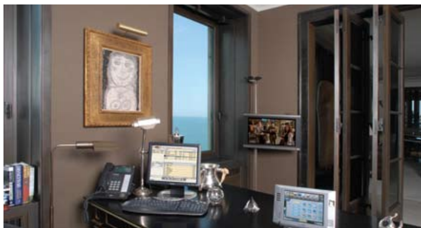
The Virtual Office: AMX Web and Computer Control applications enable easy access of a PC from an AMX Touch Panel, or access to the AMX system from anywhere over the Internet.