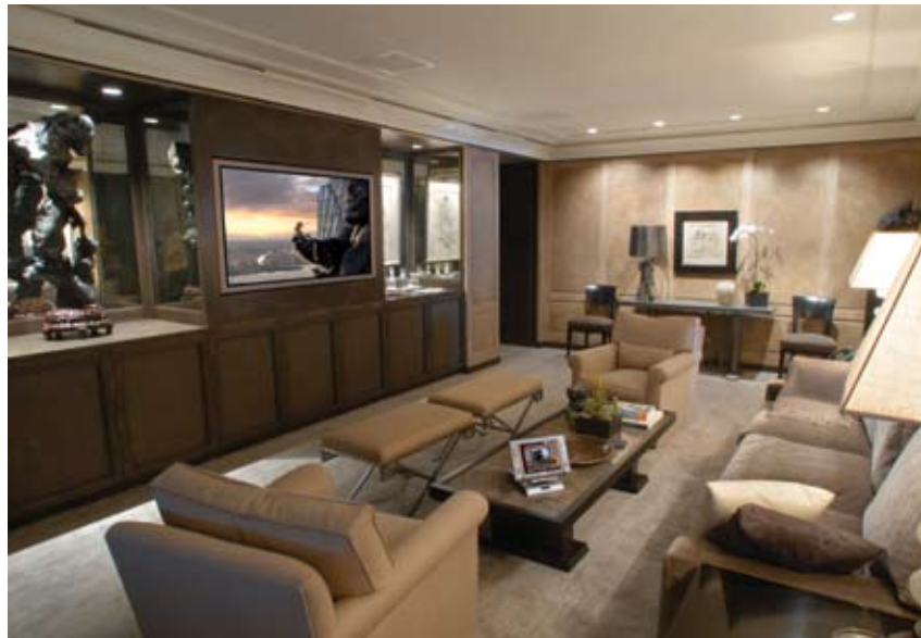
Maximum Home Theater: The Duchossois family enjoys having hundreds of movies and music titles available at their fingertips in their relaxing home theater.

"Coming in, one button. Going out, one button. Security, one button. Sound system...you've got lots of buttons, but it's easy to pick one right from the chute. Really, it's an ease of living issue."