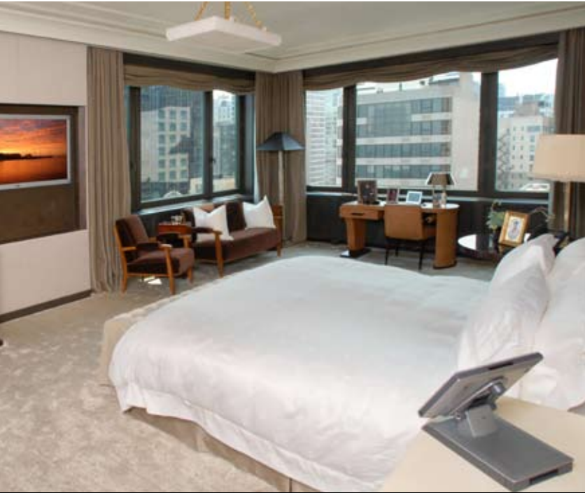
Whole Home Control: Home lighting, climate and entertainment controls can be accessed from an AMX Touch Panel located on the nightstand.