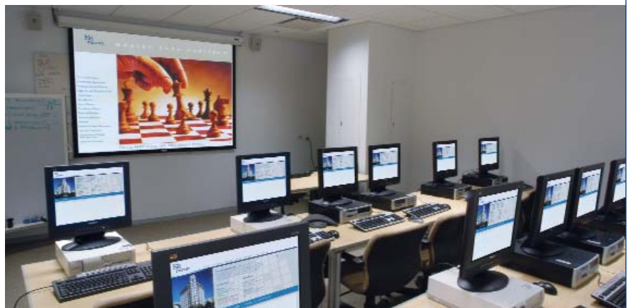
The Training Room