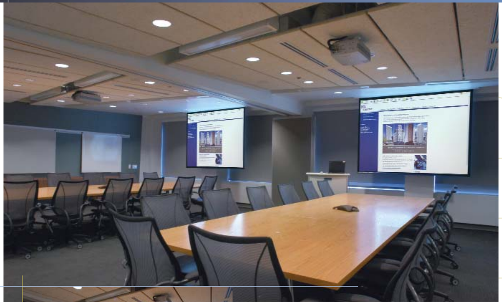
The Chicago and Montreal rooms combined (above) and used separately (at left)