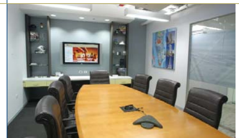
The New York Room