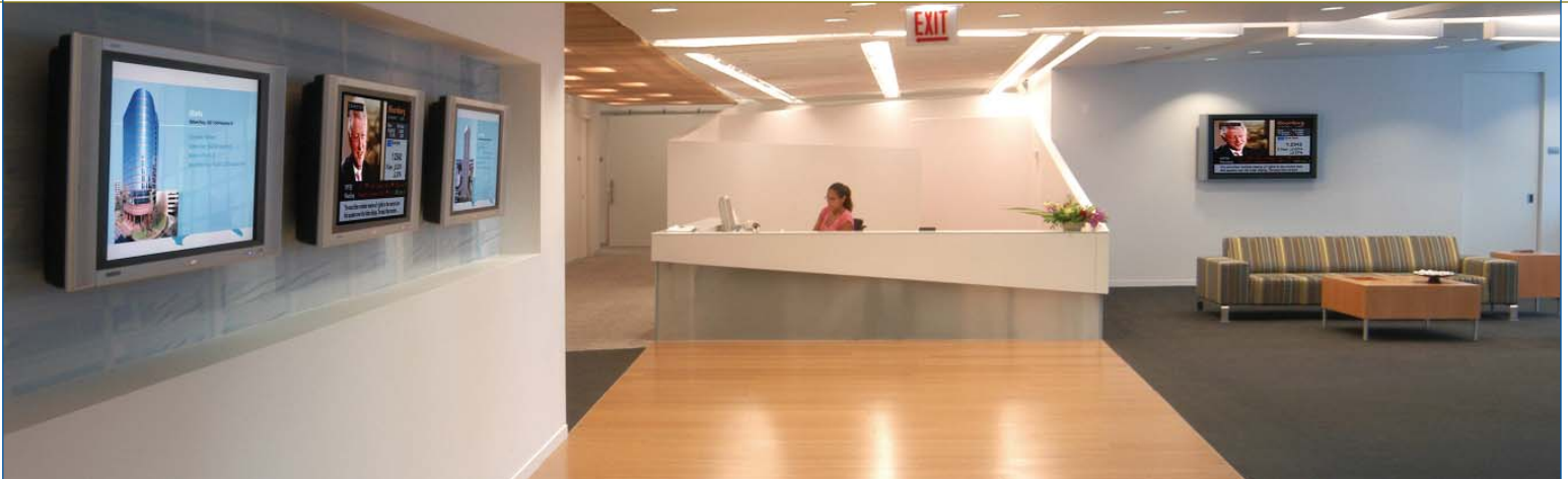
The lobby with three Sharp LCD monitors at left and a 50" LG plasma display in the background.

“The idea is to have a series of videos telling the Trizec story or about our involvement in the community or a special event. Visitors have an electronic brochure right in front of them.”