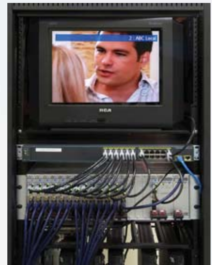
VSI Media Processing Platform at Metro (the system includes four platforms with 57 AVN-220 encoder blades installed)

Optimal created an entirely new application designed specifically for the needs of the health care industry, then utilized IPTV technology to merge