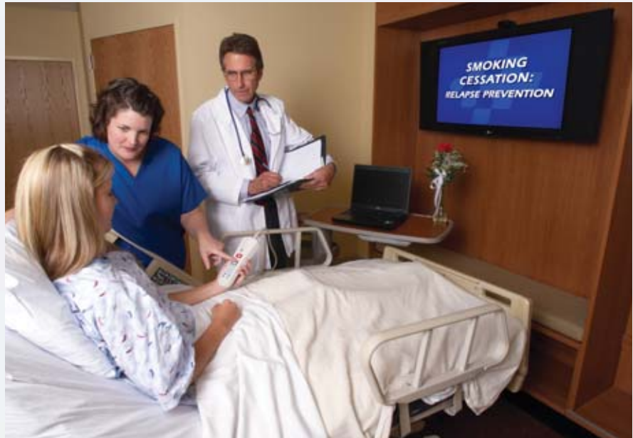
Staff explain the patient education video system at Metro Hospital

Metro wanted far more than TV, but finding a system that gave them everything they wanted wasn't easy. Many of the IP based systems they looked at offered no flexibility in terms of content and were basically leased, not owned. "They wanted you to pay per patient room, per day," says King. "Whether there was a patient in there or not."