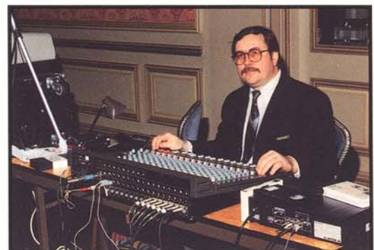
This page: setting up at the Four Seasons Hotel, Chicago

W ith Midwest Visual you can stop trying to be an AV expert and concentrate on the message you need to deliver.